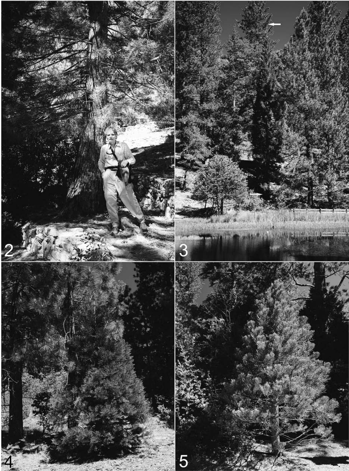
Fig. 2–5. Sequoiadendron giganteum at Lake Fulmor (1625 m el.), northwestern San Jacinto Mountains, Riverside Co., California (see Fig. 1 for locations of trees).—2–3. Parent tree (#2r) 45 cm DBH, ca. 20 m tall, ca. 35 years old, with Rudolf Schmid. Arrows indicate top and bottom of tree; note the long leader.—4–5. Entirely vegetative offspring (#1, #3) 5 and 3.5 m tall, respectively..